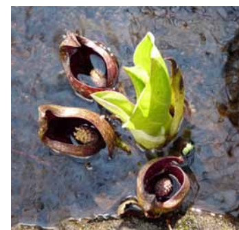
above: Highstead skunk cabbage in the early spring.

With hundreds of acres of protected forestland contiguous to Highstead (owned by the Redding Land Trust, the Town of Redding, private citizens, and The Nature Conservancy), we are working with our partners to conserve the regional habitat connectivity so important to people and wildlife, particularly in a time of climate change. Highstead's work with the Fairfield County Regional Conservation Partnership, as reported by Bill Labich in this issue, is also focused on expanding the scale of conservation. It is through such local conservation, connected to regional collaboration and an inspiring vision, that New England will successfully conserve its invaluable forestlands. I look forward to working with all of you on this vital goal as we move forward.