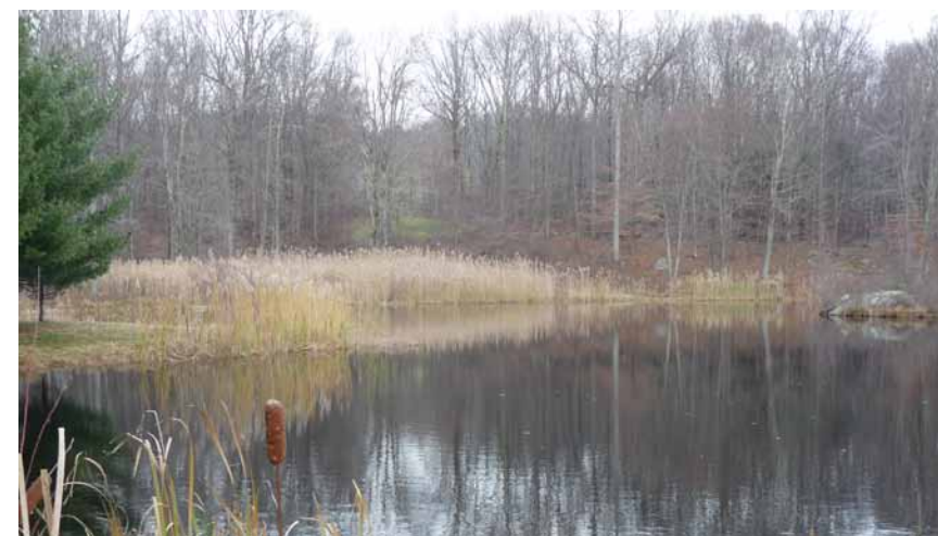
above: Highstead pond with patch of invasive Phragmites grass on far side.

This reality lies at the heart of "adaptive management," an ecological concept that considers each management action as part of a long-term experiment with appropriate controls (unmanaged areas) and rigorous data collection to evaluate consequences, changes, and success. Management activities are adjusted based on results in the context of the original plan and objectives. Although a few organizations in New England use this approach, the majority of land management occurs without consistent monitoring and evaluation and little assessment of long-term effects. This is not just a New England problem. In the words of Australian ecologist David Lindenmayer and his American co-author Jerry Franklin in a recent book on ecosystem management, the state of forest monitoring around the world is "appalling."